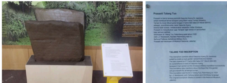
Figure 2. Reproduction of the Talang Tuo Inscription at the TWKS Museum

The Talang Tuo inscription is of significant historical importance for understanding the early dynamics of the Sriwijaya Kingdom. This inscription dates to 684 AD, during the reign of Dapunta Hyang Sri Jayanasa, recognized as the kingdom's inaugural king and founder. Its existence serves as verifiable evidence of Sriwijaya's status as a significant power with extensive influence in Southeast Asia [10]. This inscription historically affirms that Srivijaya was not solely a kingdom of political and economic dominance but also a civilization with a robust ideological and cultural foundation. This indicates that from its inception, Srivijaya had defined itself as a hub of maritime authority with historical and philosophical validity.