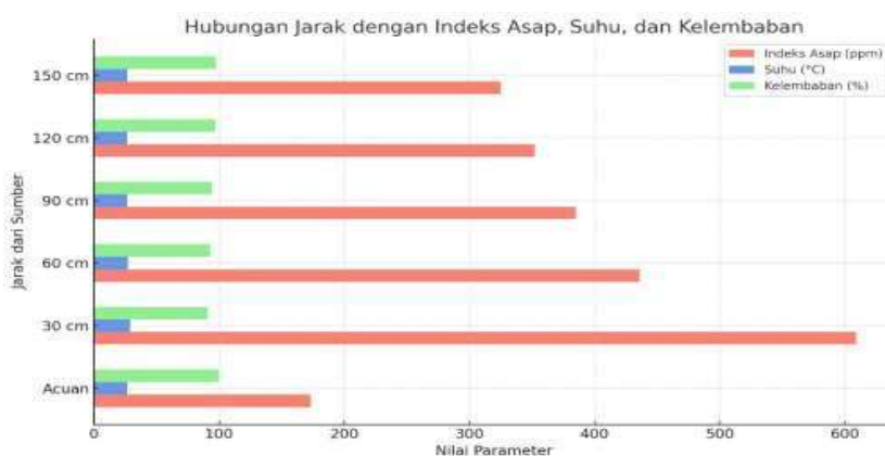
Figure 2. Relationship between Distance and Smoke Index, Temperature, and Humidity

parameters and distance, Figure 2 presents a diagram showing the trend of changes in each parameter at various measurement distances from the smoke source of waste combustion.