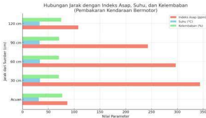
Figure 3. Relationship between Distance and Smoke Index, Temperature, and Humidity

To test the effect of distance on air quality due to exhaust fumes from motor vehicles, three main parameters were measured: exhaust gas concentration (ppm), temperature ( ^{\circ}\text{C} ), and humidity (%). Measurements were conducted at five different distances from the emission source: 0 cm, 30 cm, 60 cm, 90 cm, and 120 cm. The data are presented in horizontal bar graphs to illustrate the relationship between distance and changes in the values of each parameter and to evaluate the decrease in pollution intensity with increasing distance from the pollutant source.