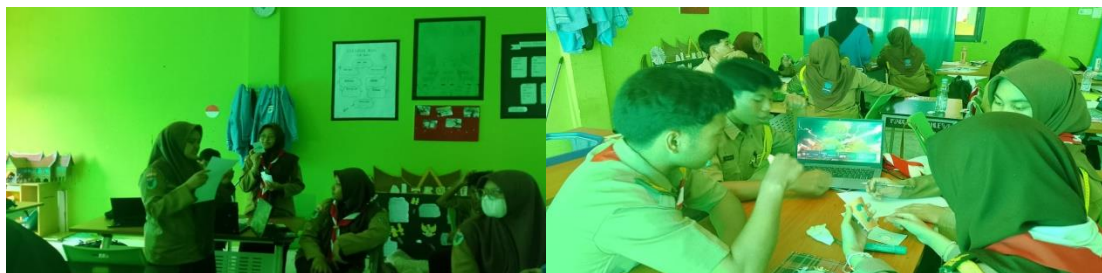
Figure 3. Classroom Atmosphere