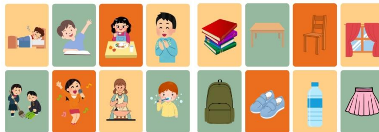
Figure 2. Picture Cards Medium

The findings of this research reveal that the use of Picture Cards (see Figure 2) as a teaching medium significantly improved students' vocabulary mastery in the experimental class. The mean score of the experimental group increased from 62.48 in the pre-test to 81.91 in the post-test, showing a notable gain of 19.43 points. In contrast, the control class only improved from 58.09 to 65.87, with a smaller increase of 7.78 points. This comparison demonstrates that students who received the treatment through Picture Cards achieved greater progress than those who learned through conventional methods.