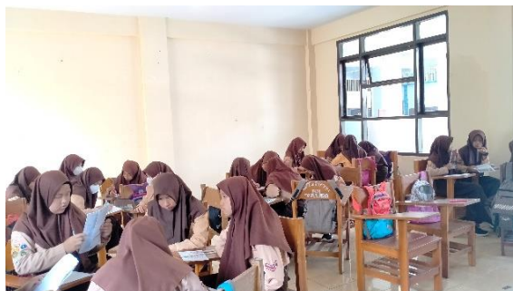
Figure 3. Cooperative Phase