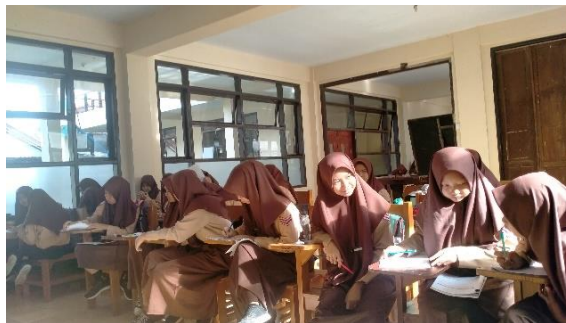
Figure 2. Orientation Phase