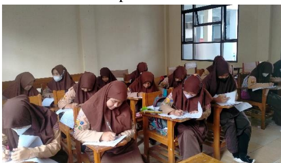
Figure 6. Closing Phase

After the pretest and posttest were conducted, the data obtained were analyzed to determine the increase in students' understanding of mathematical concepts in the experimental and control classes. Then after knowing the increase, it was analyzed by statistical tests to find out the difference in the increase in students' understanding of mathematical concepts between the experimental class and the control class. After the results obtained that the data were normally distributed but not homogeneous, a t-test was carried out to determine whether or not there was a significant difference between the experimental class that received the application of the CIRC learning model with the mind