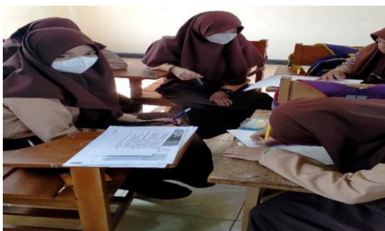
Figure 4. Integrated Reading and Composition Phase