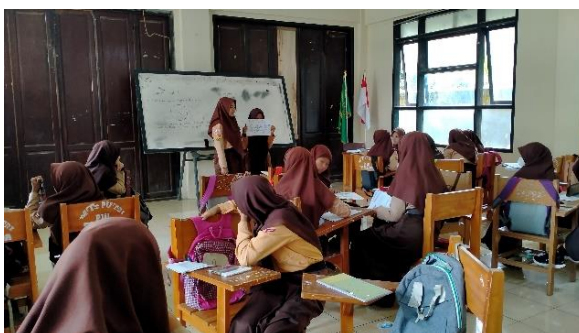
Figure 5. Publication Phase