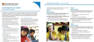
Figures 4 and 5. Cambridge Curriculum Outline

"When the topic is close to their daily life, students are more confident and willing to participate. Stories and pictures help young learners feel safe and interested. They do not feel like they are learning something difficult, but they still learn English naturally" (T2).