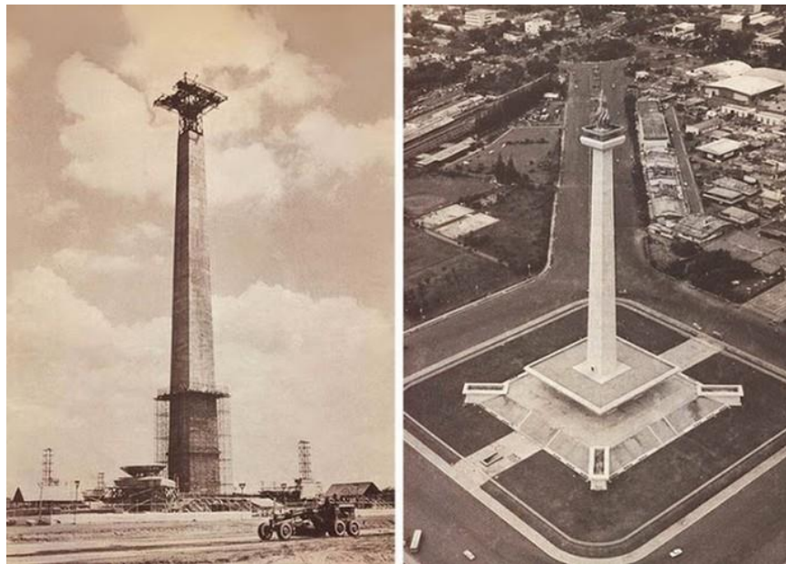
Figure 3. Construction of the National Monument

minister of home affairs, supported by a local representative council serving as the legislative body. Following the dissolution of the federal system in 1950, Indonesia reverted to a unitary state, with Jakarta continuing as the capital of the Republic of Indonesia. Simultaneously, the city underwent swift development as a hub of national governance, diplomacy, and the contemporary economy, with state institutions, foreign representatives, and international corporations contributing to the formation of Jakarta's identity as a postcolonial metropolis [38].