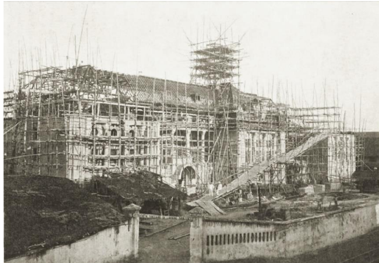
Figure 2. The construction process of the De Javasche Bank building.

ethnicity, evident in the delineation of residential zones, including the European Quarter in Weltevreden, the Vreemde Oosterlingen (Chinese and Arab) district in Glodok, and indigenous locales on the periphery of the city, such as Tanah Abang and Kemayoran [17], [18]. This spatial division was both geographic and socio-economic, establishing an urban pattern that mirrored the colonial hierarchy and European racial supremacy over other groups.